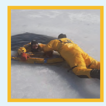
Water safety is not just during warmer weather months. Above the PTFD practices ice rescue.